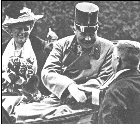
Archduke Franz Ferdinand and Duchess Sophie at Sarajevo on 28 th June, 1914

The visit. Franz Ferdinand accepted the invitation of Bosnia’s governor, General Oskar Potiorek, to inspect the army maneuvers being held outside Sarajevo. The Archduke’s role as Inspector General of the Army made the visit logical. It had also been four years since a prominent Habsburg had made a goodwill visit to Bosnia. The visit would also roughly coincide with his 14 th wedding anniversary. While his wife Sophie, not being of royal blood, was not permitted to ride in the same car as her royal husband back in Vienna, such taboos did not apply to provincial cities like Sarajevo. During the visit, Sophie would be able to ride beside her husband – a thoughtful anniversary gift. Security during the visit was not tight. Franz Ferdinand was a brave man and disliked the presence of secret service men. Nor did he like the idea of a cordon of