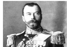
Russian Tsar Nicholas II, executed during World War I