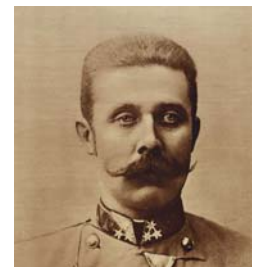
Austrian Archduke Ferdinand, assassinated to spark World War I