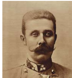
Austrian Archduke Ferdinand, assassinated to spark World War I