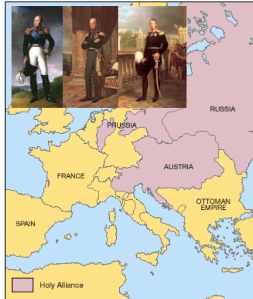
After the defeat of Napoleon, on September 26, 1815, in the name of the Trinity, the so-called Holy Alliance was proclaimed by the Tsar of Russia, and the Austrian and Prussian empires. Pictured from left to right is the Holy Alliance of Tsar Alexander I of Russia, Emperor Francis I of Austria, and King Friedrich Wilhelm III of Prussia.

The 1815 Holy Alliance and the 1815 Fourth Partition of Poland. The coalition of Russia, Austria, and Prussia created in 1815 at the behest of Tsar Alexander I of Russia is known as the Holy Alliance, and was signed by the three powers in Vienna on September 26, 1815. The aim of the Holy Alliance was to uphold the European peace settlement concluded at the Congress of Vienna a few months earlier, which included the 1815 Fourth Partition of Poland.