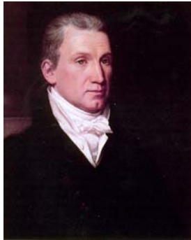
President James Monroe

The 1815 Holy Alliance and the “fourth part of the world.” The Holy Alliance also tried to interfere with Latin America, but was stopped by British disapproval and by the Monroe Doctrine of United States President James Monroe, whose interest was in protecting the independence of countries in the “fourth part of the world.”