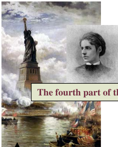
The fourth part of the world