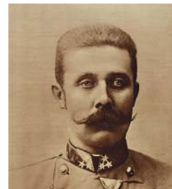
Austrian Archduke Ferdinand, assassinated to spark World War I