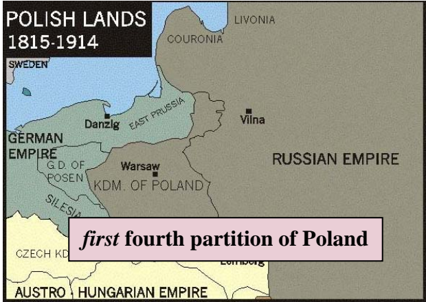
first fourth partition of Poland

The first Fourth Partition of Poland was a result of the 1815 Congress of Vienna.