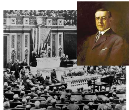
Woodrow Wilson's war message to Congress