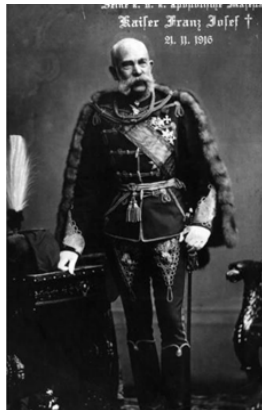
1916 picture of Franz Joseph