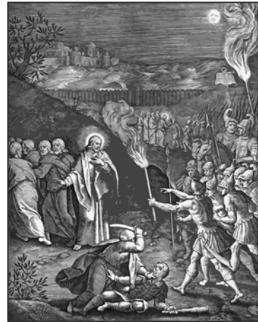
An artist's depiction of Peter drawing the sword

It is clear that there was a direct relationship between the condition of Peter's heart when he drew the Sword (John 18:10-11), and his willingness to deny Jesus Christ (John 18:17, 25-27). Jesus had warned Peter of this (John 13:37-38), knowing that Peter himself was not spiritually ready for his own cross.