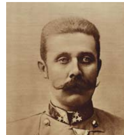
Austrian Archduke Ferdinand, assassinated to spark World War I