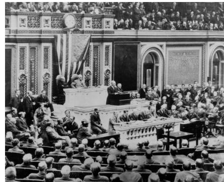
Woodrow Wilson addressing Congress on April 2, 1917

The world must be made safe for democracy. Its peace must be planted upon the tested foundations of political liberty.