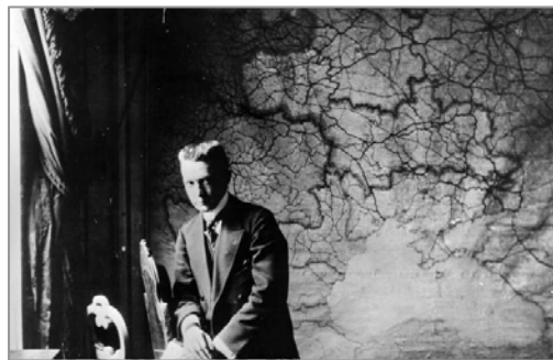
Alexander Kerensky in front of a map of the Pale of Settlement

Revelation 6:2 (KJV) And I saw, and behold A WHITE HORSE : and HE THAT SAT ON HIM [Woodrow Wilson on April 2, 1917 – and we can call his horse Man o’ War ] HAD A BOW ; and a crown was given unto him: and HE WENT FORTH CONQUERING, AND TO CONQUER.