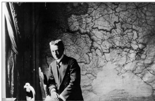
Alexander Kerensky in front of a map of the Pale of Settlement

Revelation 6:2 (KJV) And I saw, and behold A WHITE HORSE : and HE THAT SAT ON HIM [Woodrow Wilson on April 2, 1917 – and we can call his horse Man o’ War ] HAD A BOW ; and a crown was given unto him: and HE WENT FORTH CONQUERING, AND TO CONQUER.