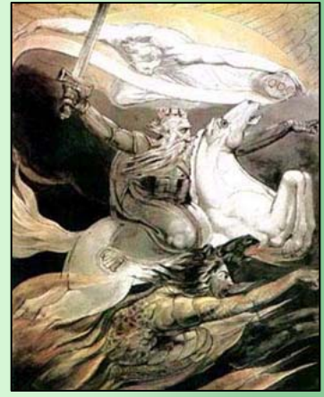
Constantius Chlorus, the Pale, father of Constantine the Great

Revelation 6:7-8 (KJV) And when he had opened the FOURTH SEAL , I heard the voice of the fourth beast say, Come and see.