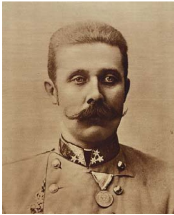
Austrian Archduke Franz Ferdinand

We are setting up later understandings with this Unsealing. [Note added for the purpose of this Unsealing #2297: This is the time of the “later understandings” referred to in the previous sentence.] The theme of Prince was totally connected with the theme of the Austrian Successor in World War I.