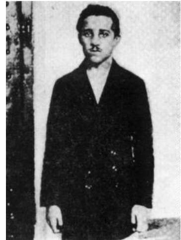
Gavrilo Princip, assassin of Austrian Archduke Franz Ferdinand

The Princes of World War I. World War I was triggered by the June 28, 1914, assassination in Sarajevo of the Austrian Archduke Franz Ferdinand , heir presumptive to the throne of the Austrian-Hungarian Empire. Franz Ferdinand was Prince Imperial of Austria, and Prince Royal of Hungary and Bohemia. His assassin was a Bosnian Serb, Gavrilo Princip , whose name happens to mean Prince . Princip was committed to the independence of the Southern Slavic people (Yugo Slavs) from the Austrian-Hungarian Empire. A month later Austria would declare war on Serbia, beginning World War I.