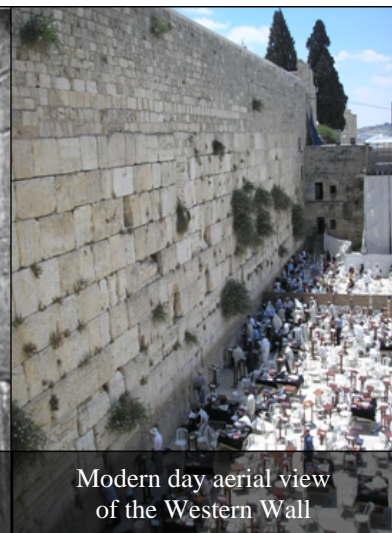
Modern day aerial view of the Western Wall