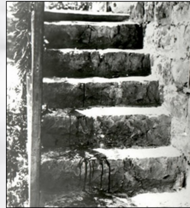
In the riots, 133 were brutally murdered, including 67 in Hebron, 18 in Safed.

The British had made promises to both Arabs and Zionists. The 1917 Balfour Declaration supported the establishment of a “national home” for the Jews, while pledging that nothing would be done to “prejudice the civil and religious rights” of the Arabs. But the very presence of a Jewish homeland would, Arabs insisted, infringe on those rights.