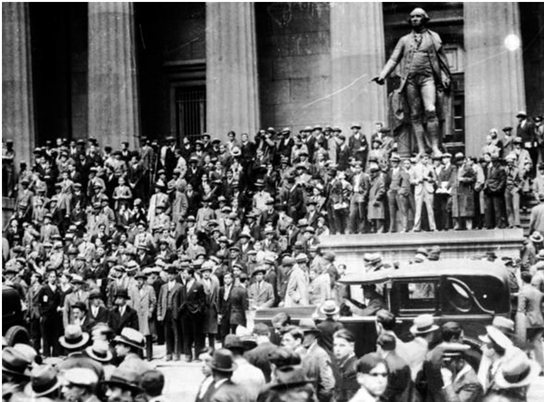
Huge crowds gather outside the Sub Treasury Building (now Federal Hall National Memorial) and around the statue of George Washington, opposite the New York Stock Exchange, at the time of the Wall Street Crash in October 1929. The Statue of Washington commemorates where he was sworn in as the first President of the United States by Robert R. Livingston on April 30, 1789.

financial gains of the great bull market were shattered on Black Thursday, when share prices on the NYSE collapsed. Stock prices fell on that day and they continued to fall, at an unprecedented rate, for a full month.