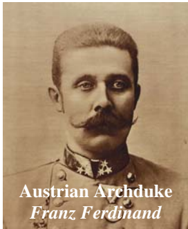
Austrian Archduke Franz Ferdinand

Key Understanding #1: Why a “prince” was assassinated to start World War I. The Lord ordained the assassination of a prince, Archduke Franz Ferdinand, who was the heir to the throne of a kingdom, the Austrian-Hungarian Empire, to ignite World War I, for the purpose of the fulfillment of “the prince that shall come” in Daniel 9:26. The fulfillment of “the prince that shall come” of Daniel 9:26 centers around the theme of a prince inheriting a throne, which is why the assassination of Archduke Franz Ferdinand is a central event toward the fulfillment of the passage.