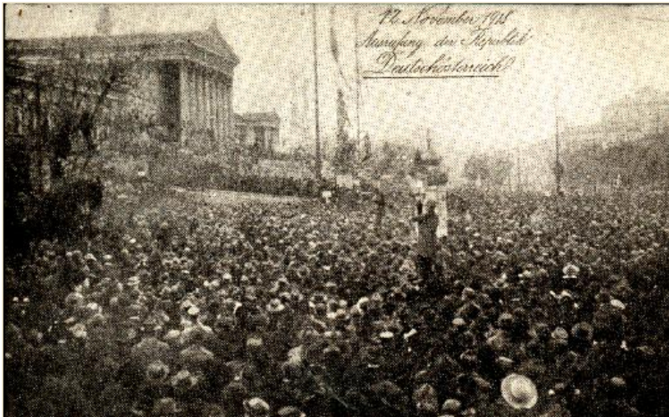
Vienna, November 12, 1918. Austria becomes a republic.

World War I ends. The last Habsburg emperor is overthrown. Austria becomes a republic.