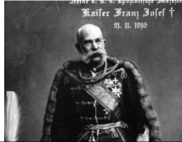
The death of Austrian Emperor Franz Joseph, who had ruled the Austrian Empire for 68 years.