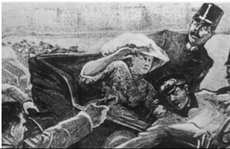
The assassination of Archduke Franz Ferdinand by Gavrilo Princip. The event sparked World War I, which brought forth the demise of the Austrian-Hungarian Empire.