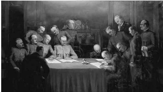
Austrian armistice signed, takes effect