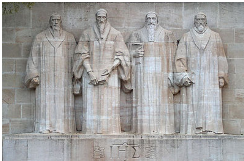
Reformation Wall in Geneva. From left: William Farel, John Calvin, Theodore Beza, and John Knox