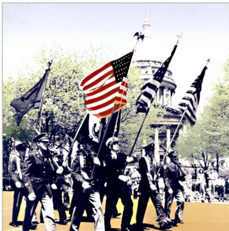
The 'Body of Americans' has prophetically represented the entity of the Lord's Holy Nation/Holy Temple Gentile Christian New Israel

Said yet another way, neither the Christian New Israel (the Body of Americans) nor the Jewish new Israel (the Body of Israelis) is led by the Spirit of the living God.