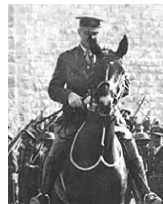
General Edmund Allenby riding away from the Jaffa Gate in Jerusalem, after his formal entry on foot

Although he was a supreme master of cavalry horse warfare, British General Edmund Allenby entered Jerusalem on December 11, 1917, on foot through the Jaffa Gate (above) out of his great respect for the status of Jerusalem as the Holy City, important to Judaism, Christianity, and Islam.