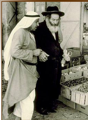
Jerusalem is in bondage with her children

[Note: This is speaking of the heavenly New Jerusalem of which true Christians who have forsaken in their hearts their earthly kingdom citizenships are citizens.]