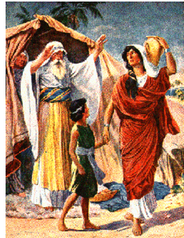
Abraham casting out Hagar and Ishmael

23 But he who was of the bondwoman was born after the flesh; but he of the freewoman was by promise. [NIV . . . His son by the slave woman was born in the ordinary way; but his son by the free woman was born as the result of a promise.]