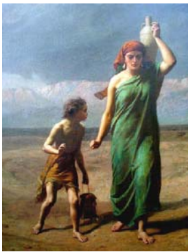
Ishmael and Hagar

Four Score and Six Years Old The age of Abram when Ishmael was born ( below left ), and the age of Abraham Lincoln’s America at the Battle of Gettysburg ( below right )