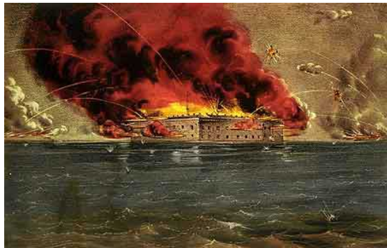
Abner Doubleday (right) fired the first shot for the North in the Civil War, at Fort Sumter (left), April 12, 1861