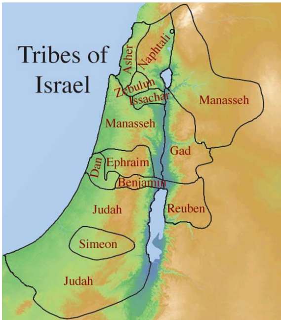
Old Canaan Tribes of Israel in Canaan

Revelation 17:08 – God giving the land of ‘New Canaan’ America to the ‘New Israel’ Christians Revelation 17:8 (KJV) THE BEAST THAT THOU SAWEST WAS, AND IS NOT; AND SHALL ASCEND OUT OF THE BOTTOMLESS PIT, and go into perdition: and they that dwell on the earth shall wonder, whose names were not written in the book of life from the foundation of the world, when they behold the beast that was, and is not, and yet is.