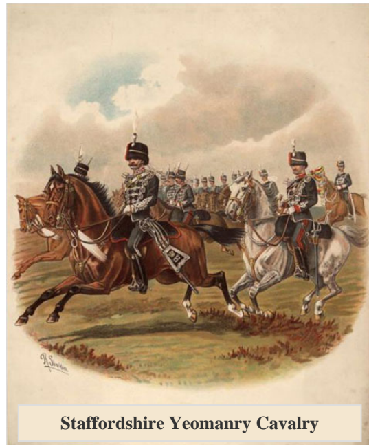
Staffordshire Yeomanry Cavalry

The story. Pitt the Younger's Staffordshire Yeomanry was ordered to join the Egyptian Expeditionary Force in 1915. The Regiment was attached to the Yeomanry Mounted Division in the Sinai and Palestine campaign against the Ottoman Turkish and German army in 1916-1918. It fought in the indecisive First Battle of Gaza and Second Battle of Gaza in March and April 1917. They finally won through in the Third Battle of Gaza (October 31 – November 7, 1917) on November 6, 1917, where Allied victory at last left the field open for the capture of Jerusalem on December 9, 1917. In July 1918 the Division was reformed as the Fourth Cavalry Division under the command of General Edmund Allenby and the Regiment played a key role in the decisive Battle of Megiddo in September 1918.