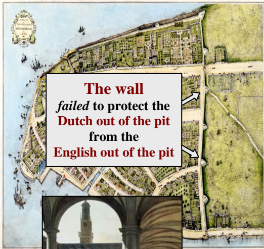
The Old Amsterdam stock exchange fell

The Wall failed and the stock exchange fell