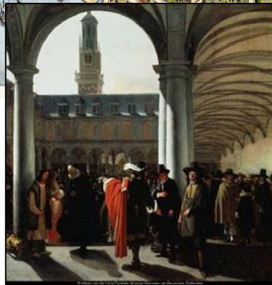
Old Amsterdam stock exchange