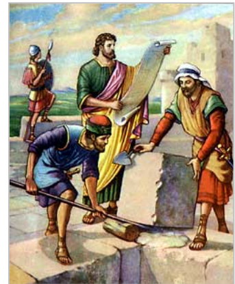
Nehemiah supervised the rebuilding of the wall of Jerusalem

Daniel 9:25-27 (KJV) Know therefore and understand, that from the going forth of the commandment to restore and TO BUILD JERUSALEM unto THE MESSIAH THE PRINCE shall be seven weeks, and threescore and two weeks [69 weeks]: THE STREET SHALL BE BUILT AGAIN, AND THE WALL, even in troublous times. 26 And after threescore and two weeks shall Messiah be cut off, but not for himself: and the people of THE PRINCE THAT SHALL COME SHALL DESTROY THE CITY AND THE SANCTUARY; and the end thereof shall be with a flood, and unto the end of the war desolations are determined. 27 And he shall confirm THE COVENANT with many for ONE WEEK [1 week]: . . .