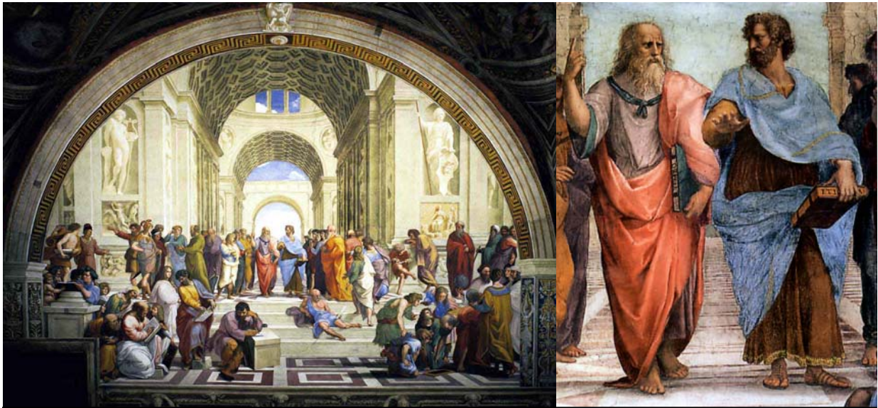
(left) School of Athens by Raphael, 1511. (right) Detail of Plato and Aristotle from Raphael's School of Athens .

10 Fear none of those things which thou shalt suffer: behold, the devil shall cast some of you into prison, that ye may be tried; and ye shall have tribulation ten days: be thou faithful unto death, and I will give thee a crown of life.