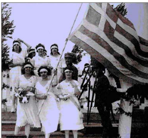
Greek girls celebrate the liberation of Smyrna from the Ottoman yoke

May 15, 1948 Birth of Israel represented the Jews of Israel as counterfeit Jewish “true Jews” of God, fulfilling Revelation 2:9