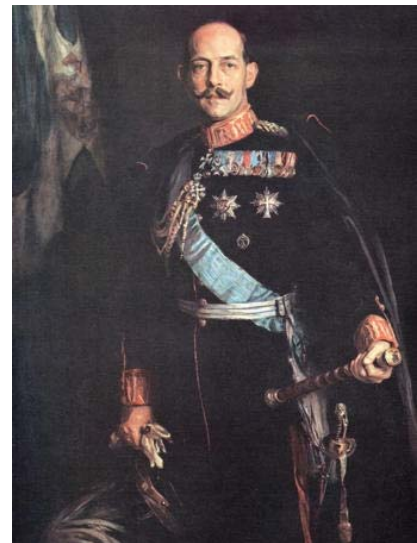
King Constantine I

Bulgaria (1913). As a result of these conflicts Greece gained territory from its defeated rivals.