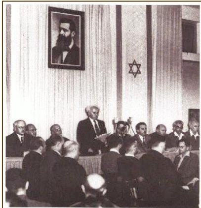
David Ben-Gurion establishing Israel on May 14, 1948

Key Understanding: Peace and justice upon the throne of David Ben-Gurion. David Ben-Gurion (pictured on the left) became the first Prime Minister of Israel. Because of (i) the spiritual error in the Declaration of the Establishment of the State of Israel that its establishment would be based on “freedom, justice and peace as envisaged by the prophets of Israel,” which in truth is reserved for the reign of the Messiah, and because (ii) the wording can be seen to be a clear counterfeit of Isaiah 9:6-7, it can be seen that the Lord ordained a man named David – David Ben-Gurion – to be the first Prime Minister of Israel so as to reveal that counterfeit.