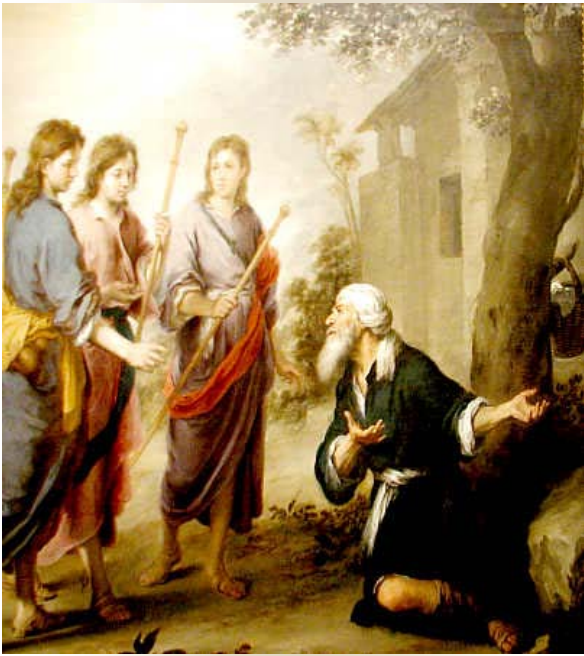
Angels visited Abraham, telling him Sarah would have a son (Isaac); Sarah laughed to herself (Genesis 18)

In the pattern that Isaac was born to Sarah . . . . . Joseph was born to Rachel