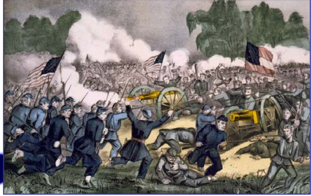
Battle of Gettysburg painting

1 Chronicles 28:3 (KJV) But God said unto me [King David], THOU SHALT NOT BUILD AN HOUSE FOR MY NAME, BECAUSE THOU HAST BEEN A MAN OF WAR, AND HAST SHED BLOOD.