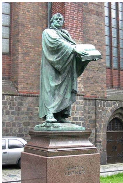
Martin Luther (1523):

Let’s note again, as was originally discussed in Unsealing #840 The Lutheran Seminary at Gettysburg – Martin Luther and Just War, part 3 , Luther’s position on Just War, that Martin Luther used the example of Abraham in Genesis 14 to justify “just war” by New Testament Christians.