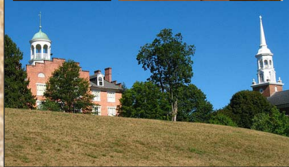
Abraham and Martin Luther and “just war”. Abraham Lincoln represents the ‘Martin Luther’ Church-ill’s doctrine of “just war” at Gettysburg, home of the first Lutheran seminary in the New World.

Genesis 16:16 (KJV) AND ABRAM WAS FOURSCORE AND SIX YEARS OLD, WHEN HAGAR BARE ISHMAEL TO ABRAM.