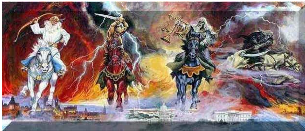
World War I

Key Understanding #1: The appearance or arrival of both (a) the tribulation saints of the fifth seal and (b) the ‘great multitude’ Revelation 7 tribulation saints occurs in conjunction with the events of the first four seals and the end of World War I. (a) The opening of the fifth seal of the white-robed tribulation saints occurs after the opening of the first four seals, the fulfillment of which is closely attached to World War I, while (b) the Capitalism and Democracy vs. Marxism/Communism tribulation for the ‘great multitude’ church-ill ‘tribe of Dan’ white-robed saints of Revelation 7:9-17 is birthed through the events of World War I.