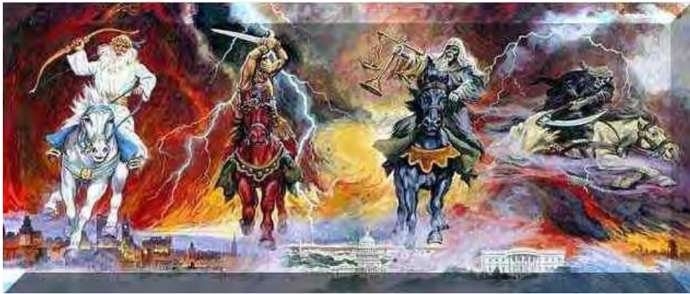
World War I

Key Understanding #1: The appearance or arrival of both (a) the tribulation saints of the fifth seal and (b) the ‘great multitude’ Revelation 7 tribulation saints occurs in conjunction with the events of the first four seals and the end of World War I. (a) The opening of the fifth seal of the white-robed tribulation saints occurs after the opening of the first four seals, the fulfillment of which is closely attached to World War I, while (b) the Capitalism and Democracy vs. Marxism/Communism tribulation for the ‘great multitude’ church-ill ‘tribe of Dan’ white-robed saints of Revelation 7:9-17 is birthed through the events of World War I.