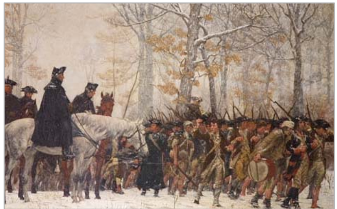
#2648 The Yom Kippur War and the Abomination of Desolation – The post-World War II U.S. waxing great toward the South and toward the East as a second Syria /Antiochus IV Epiphanes, part 907, The Palm Christians, (xxxviii), Valley Forge: “A Little Season” was represented (in the counterfeit ) through the winter soldiering of the Continental Army during the Revolutionary War, and especially at Valley Forge