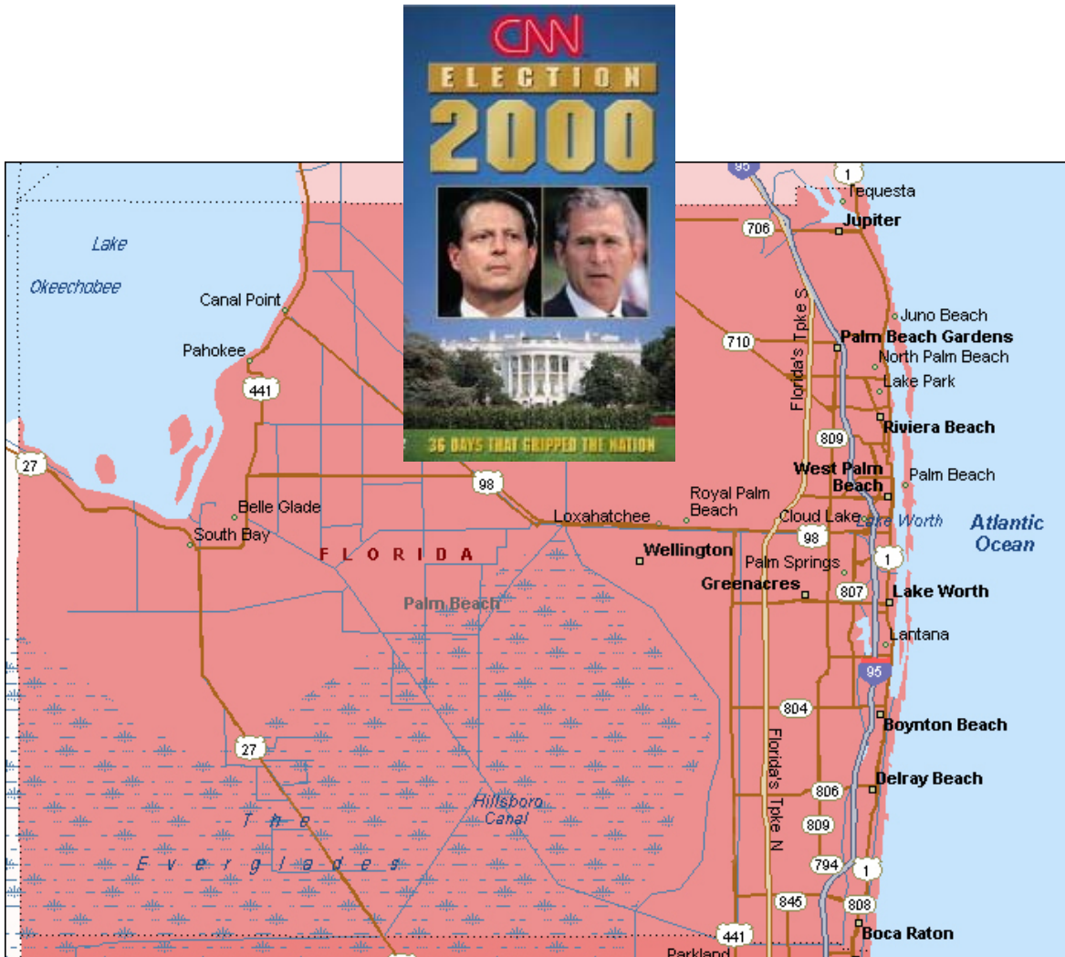
A map of Palm Beach County, Florida

Revelation 7:9 (KJV) After this I beheld, and, lo, A GREAT MULTITUDE , which no man could number, of all nations, and kindreds, and people, and tongues, stood before the throne, and before the Lamb, clothed with white robes, and PALMS IN THEIR HANDS ;