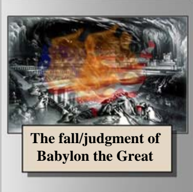
The fall/judgment of Babylon the Great

6 And I heard as it were THE VOICE OF A GREAT MULTITUDE , and as the voice of many waters, and as the voice of mighty thunders, saying, Alleluia: for the Lord God omnipotent reigneth.