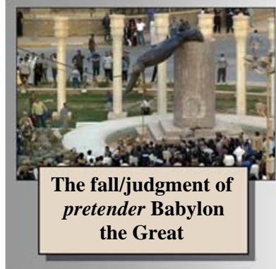
The fall/judgment of pretender Babylon the Great

Revelation 19:1-6 (KJV) And after these things I heard A GREAT VOICE OF MUCH PEOPLE IN HEAVEN , saying, Alleluia; Salvation, and glory, and honour, and power, unto the Lord our God: