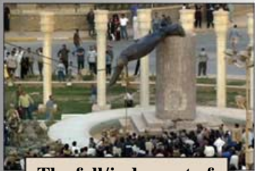
The fall/judgment of pretender Babylon the Great

Revelation 7:9 (KJV) After this I beheld, and, lo, A GREAT MULTITUDE , which no man could number, of all nations, and kindreds, and people, and tongues, stood before the throne, and before the Lamb, clothed with white robes, and PALMS IN THEIR HANDS :