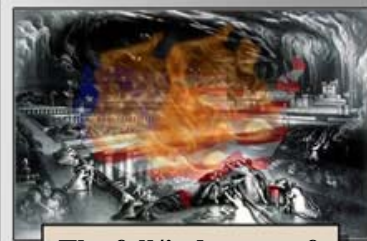
The fall/judgment of Babylon the Great