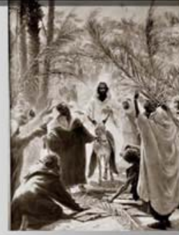
The Great Multitude have palms in their hands

6 And I heard as it were THE VOICE OF A GREAT MULTITUDE , and as the voice of many waters, and as the voice of mighty thunderings, saying, Alleluia: for the Lord God omnipotent reigneth.