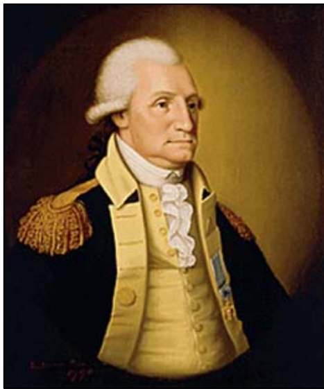
Washington (husband head)