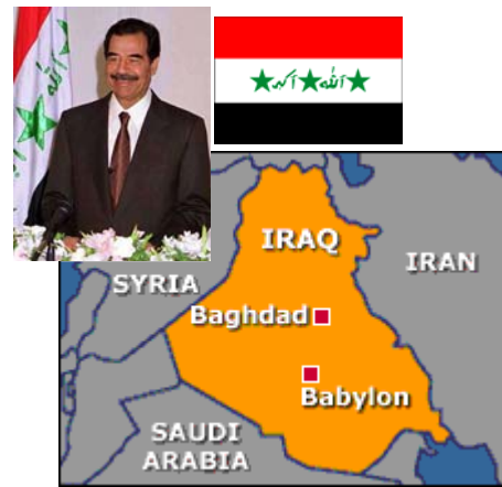
The Saddam Hussein-led regime in Iraq is the pretender Babylon the Great of Revelation 18

Revelation 6:5 (KJV) And when he had opened THE THIRD SEAL , I heard the third beast say, Come and see. And I beheld, and lo A BLACK HORSE ; and he that sat on him had A PAIR OF BALANCES IN HIS HAND . [The pair of balances represents the U.S. defeat of the Soviet Union and the U.S. defeat of the regime of Saddam Hussein.]