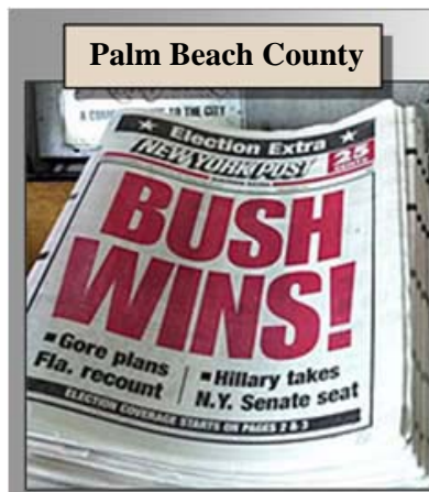
Palm Beach County

Key Understanding: 86 and the judgment upon Saddam Hussein. Why is the number 86, represented through the 86 years between the April 6 [= 9], 1917, U.S. entry into World War I and the April 9, 2003, fall of Baghdad, specifically connected to the Great Multitude and the judgment upon pretender Babylon the Great (the regime of Saddam Hussein in Iraq)? [The emphasis in the question is placed on the Great Multitude .]