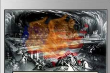
The fall/judgment of Babylon the Great

6 And I heard as it were THE VOICE OF A GREAT MULTITUDE , and as the voice of many waters, and as the voice of mighty thunderings, saying, Alleluia: for the Lord God omnipotent reigneth.