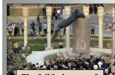
The fall/judgment of pretender Babylon the Great

Revelation 19:1-6 (KJV) And after these things I heard A GREAT VOICE OF MUCH PEOPLE IN HEAVEN , saying, Alleluia; Salvation, and glory, and honour, and power, unto the Lord our God: