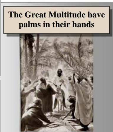
The Great Multitude have palms in their hands

Revelation 7:9 (KJV) After this I beheld, and, lo, A GREAT MULTITUDE , which no man could number, of all nations, and kindreds, and people, and tongues, stood before the throne, and before the Lamb, clothed with white robes, and PALMS IN THEIR HANDS ;