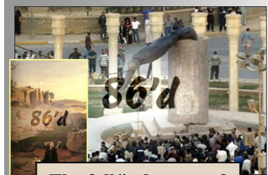
The fall/judgment of pretender Babylon the Great

Revelation 19:1-3 (KJV) And after these things I heard A GREAT VOICE OF MUCH PEOPLE IN HEAVEN , saying, Alleluia; Salvation, and glory, and honour, and power, unto the Lord our God: 2 For true and righteous are his judgments: FOR HE HATH JUDGED THE GREAT WHORE [essentially represented through the '86' seed of Ishmael], which did corrupt the earth with her fornication, and hath avenged the blood of his servants at her hand. 3 And again they said, Alleluia. And her smoke rose up for ever and ever.