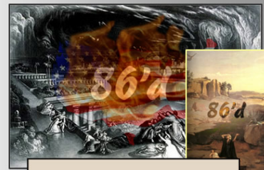
The fall/judgment of Babylon the Great

Revelation 19:1-3 (KJV) And after these things I heard A GREAT VOICE OF MUCH PEOPLE IN HEAVEN , saying, Alleluia; Salvation, and glory, and honour, and power, unto the Lord our God: 2 For true and righteous are his judgments: FOR HE HATH JUDGED THE GREAT WHORE [essentially represented through the '86' seed of Ishmael], which did corrupt the earth with her fornication, and hath avenged the blood of his servants at her hand. 3 And again they said, Alleluia. And her smoke rose up for ever and ever.