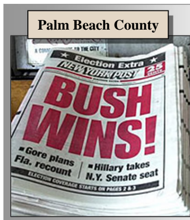
Palm Beach County

Revelation 7:9 (KJV) After this I beheld, and, lo, A GREAT MULTITUDE [of the tribe of Dan and the seed of Ishmael , represented through the number 86], which no man could number, of all nations, and kindreds, and people, and tongues, stood before the throne, and before the Lamb, clothed with white robes, and PALMS IN THEIR HANDS ;