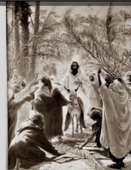
The Great Multitude have palms in their hands

Revelation 7:9 (KJV) After this I beheld, and, lo, A GREAT MULTITUDE [of the tribe of Dan and the seed of Ishmael , represented through the number 86], which no man could number, of all nations, and kindreds, and people, and tongues, stood before the throne, and before the Lamb, clothed with white robes, and PALMS IN THEIR HANDS ;