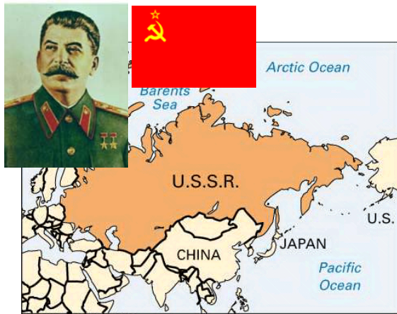
The Soviet Union is the pretender Scarlet Beast of Revelation 17