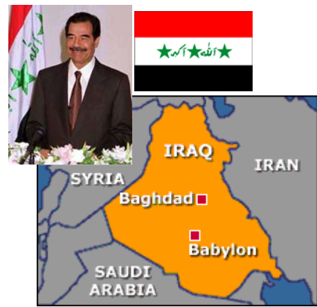
The Saddam Hussein-led regime in Iraq is the pretender Babylon the Great of Revelation 18