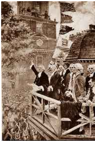
The first public reading of the Declaration of Independence was by John Nixon and occurred at high noon on July 8, 1776, in the Old State House yard in Philadelphia

June 27, 1787 Gibbon’s completion of The Decline and Fall of the Roman Empire