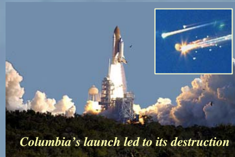
Columbia's launch led to its destruction

Revelation 18:5 (KJV) For HER [America-Babylon the Great's] SINS HAVE REACHED UNTO HEAVEN , and God hath remembered her iniquities.