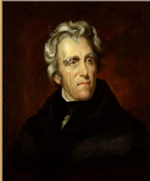
Andrew Jackson, the 7 th president

George W. Bush was elected in the year 2000 and inaugurated in the year 2001, years which represented the beginning of the 7 th millennium