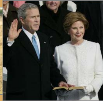
George W. Bush, the president who began the 7 th millennium

Job 11:12 (KJV) For vain man would be wise, THOUGH MAN BE BORN [with a natural birthright to life, liberty, and the pursuit of happiness] LIKE A WILD ASS'S [Jack's] COLT [son].